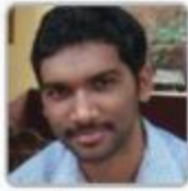
IRS Pramod Nayak