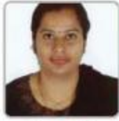
IAS Manjushree N