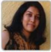
IAS Shilpa Nag